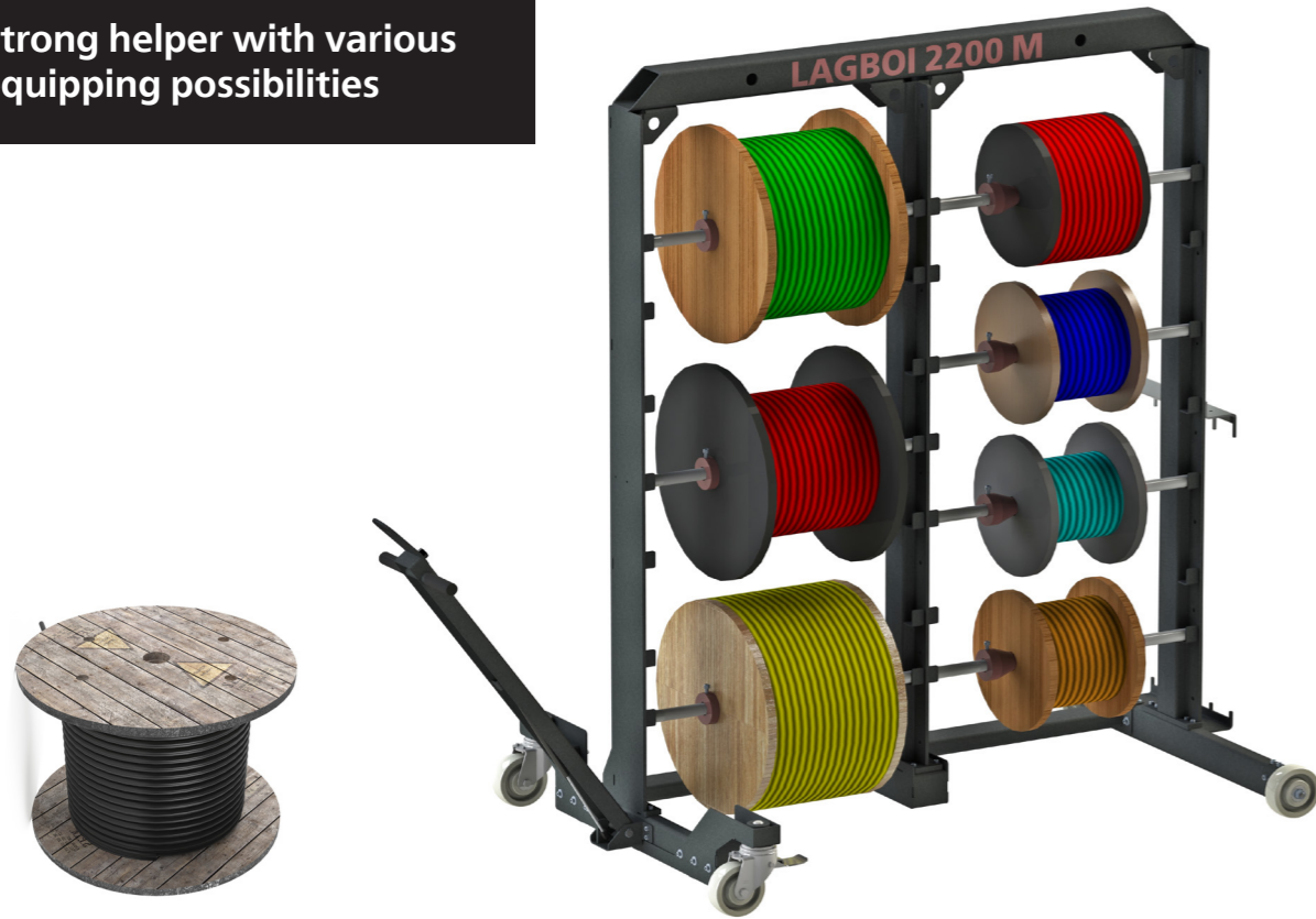
Fig. 1 LAGBOI 2200 M

Strong helper with various equipping possibilities