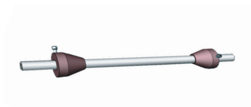
Fig. 3 Drum axle incl. centering cones