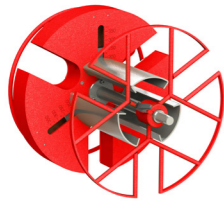
Fig. 2 Coiler head 480SL