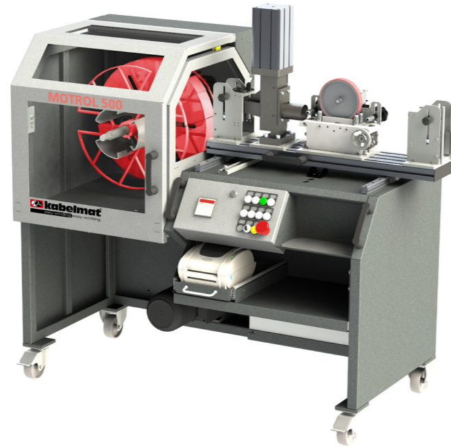
Fig. 1 MOTROL 500

Compact winding machine with high operating comfort