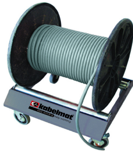
Fig. 2 TROMBOI 500 MOBILE