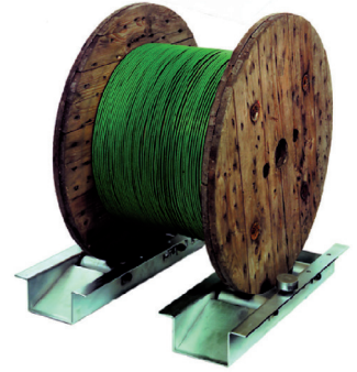
Fig. 4 TROMBOI 1400