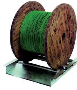
Fig. 3 TROMBOI 800